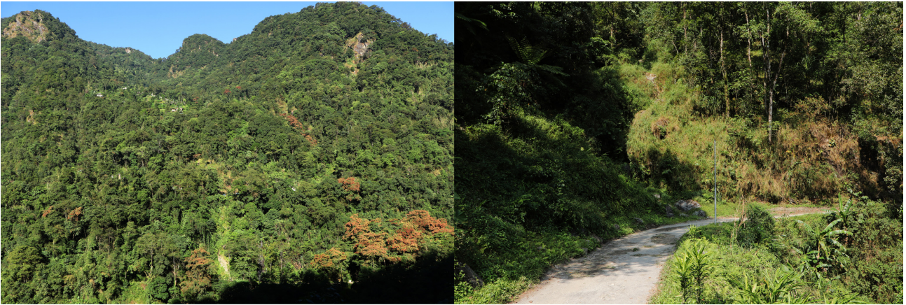
FIGURE 4. Forests surrounding Namprikdang playground, Dzongu, the habitat of Zographetus dzonguensis sp. nov.