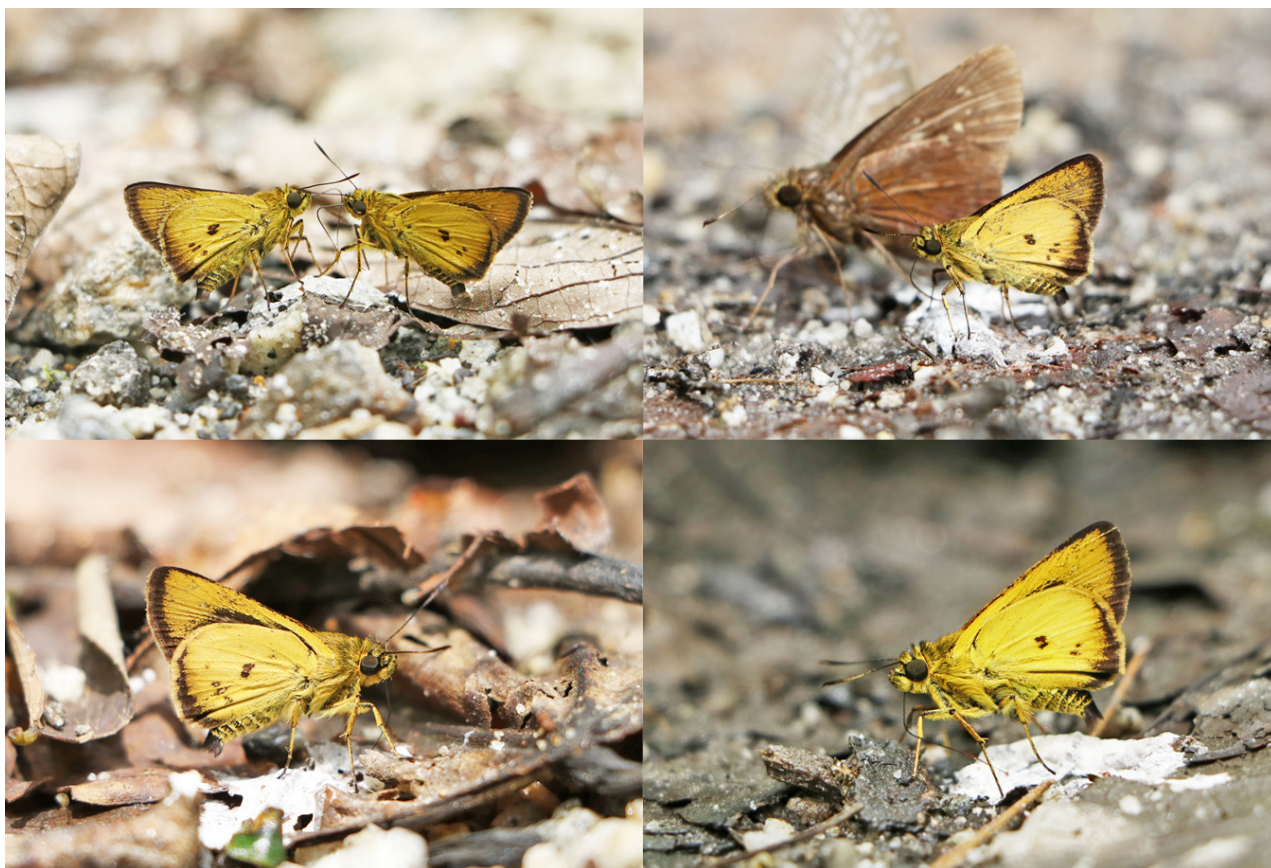
FIGURE 3. Zographetus dzonguensis sp. nov. in life. All individuals were photographed at Namprikdang playground, Dzongu, North Sikkim District, Sikkim, India in August-September 2020 and 2021.

differences, similar in degree to the previously described species in this group (Fan et al. 2007). Unfortunately, these geographically non-overlapping taxa are nowhere common and therefore the collected series are limited, and the comparative molecular data are unavailable. Therefore, it is difficult at present to further comment on their systematic positions at species and subspecies levels. We have not yet been able to generate sufficient molecular data on the three species to resolve these matters, which should be taken up in the future.