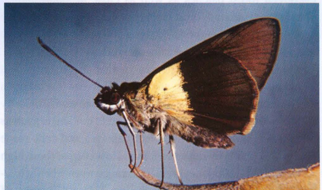
Fig. 6: Underside of freshly eclosed Q. basiflava