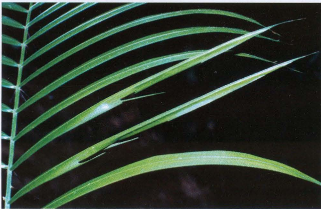
Fig. 2: Cells made by the first instar larvae