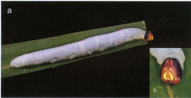
Fig. 1a: Caterpillar of Quedara basiflava ; 1b: close-up of the head