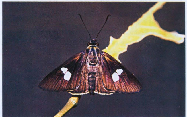
Fig. 5: Freshly eclosed Q. basiflava drying its wings