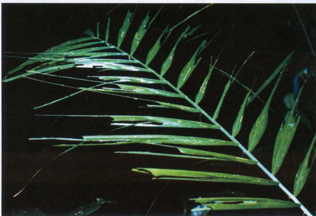
Fig. 3: Cells made by third to fifth instar larvae

The caterpillars dispersed immediately after consuming their eggshells. Each caterpillar occupied an entire leaflet to make its cell and feed, and caterpillars from the same clutch occupied adjacent leaflets. Early larval cells were small (c. 2-4 cm in length) and made in the middle of the leaf margin. These were simple tubes made by turning the leaf margin downwards and holding it in place by silk threads (Fig. 2).